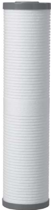
AP810-2 / AP811-2