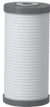
AP810 / AP811