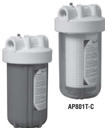
AP801 / AP801-C / AP801-1.5-C