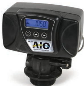
AIO System featuring the Pentair Fleck 5600AIO SXT Control Valve Shown with Optional Tank Jacket

The Nelsen AIO™ can remove up to 8 ppm Hydrogen Sulfide and up to 7 ppm Iron. A daily backwash will remove accumulated iron and replenish the filter media bed. The regeneration process also adds a fresh air pocket to the system. Calcium and hardness can also be removed when a water softener is placed after the Nelsen AIO™.