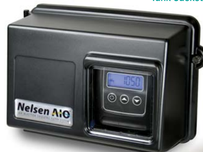
AIO System featuring the Pentair Fleck 2510AIO SXT Control Valve Shown with Optional Tank Jacket