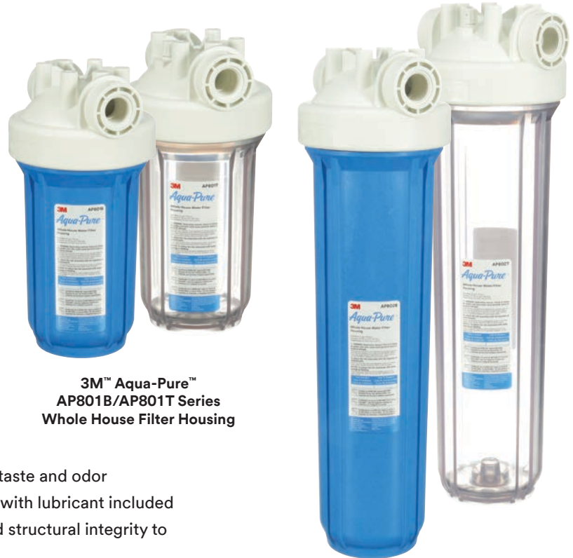
3M™ Aqua-Pure™ AP801B/AP801T Series Whole House Filter Housing